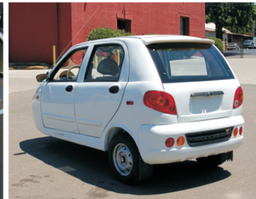
100% Electric Hatchback with plenty of storage