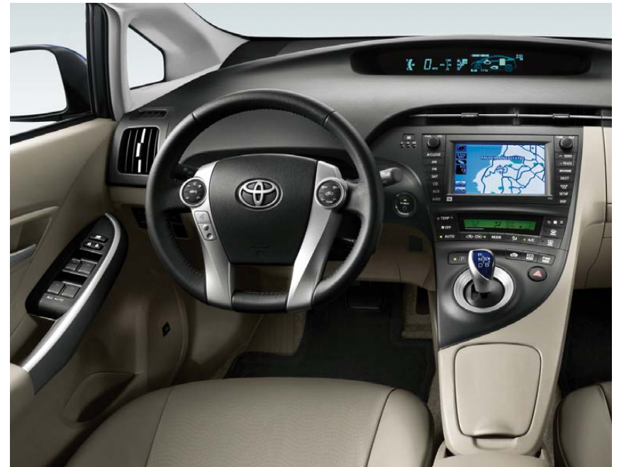
Prius Four interior shown in Bisque leather with available Navigation Package 3,4

The 2011 Prius offers something for everyone. An EPA-estimated combined 50 mpg rating 5 for those who'd like to spend less on gas. A proven third-generation Hybrid Synergy Drive ® system for those who want reliability. And those who love technology will enjoy available features like the Advanced Parking Guidance System (APGS) 6,7 and Dynamic Radar Cruise Control (DRCC) 6,8 with available Pre-Collision System (PCS) 9 . The 2011 Toyota Prius. Moving Forward.