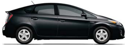
BLACK Dark Gray, Misty Gray or Bisque interior