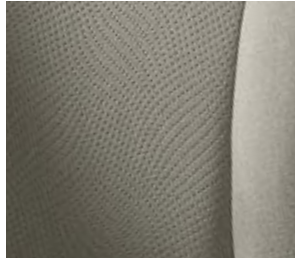
Fabric in Misty Gray