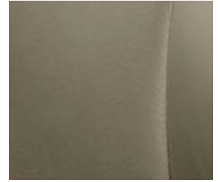
Leather available in Bisque