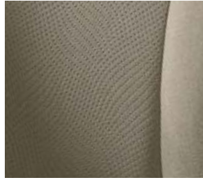
Fabric in Bisque