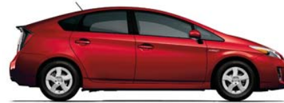
BARCELONA RED METALLIC Dark Gray or Bisque interior