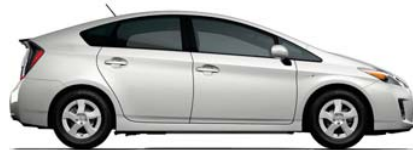
CLASSIC SILVER METALLIC Dark Gray or Misty Gray interior