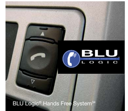
BLU Logic® Hands Free System 34