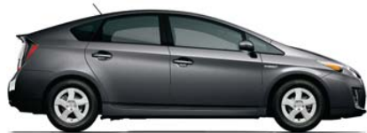
WINTER GRAY METALLIC Dark Gray or Misty Gray interior