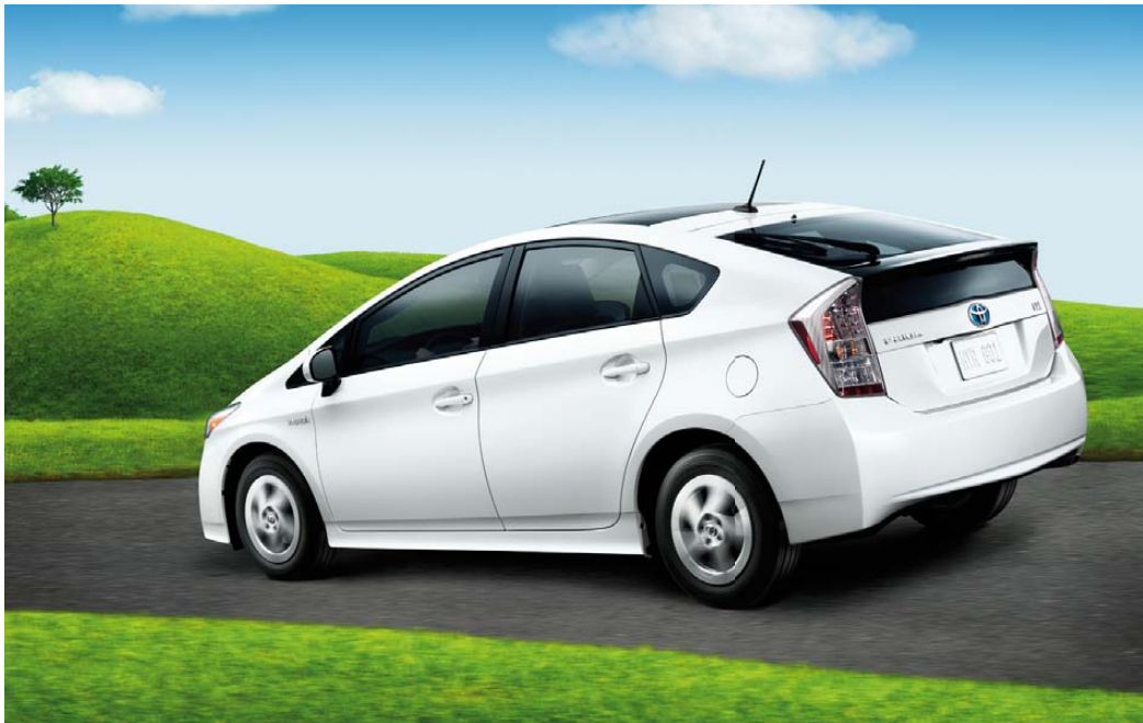
Prius Four shown in Blizzard Pearl with available Solar Roof Package 1,2