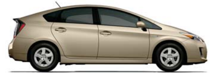
SANDY BEACH METALLIC Bisque interior