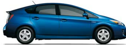
BLUE RIBBON METALLIC Dark Gray or Bisque interior