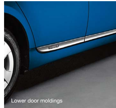
Lower door moldings