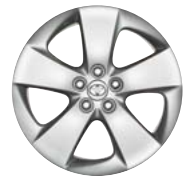
Available 17-in. alloy wheel 32

Personalize your Prius with Genuine Toyota accessories. They're as well built as the car itself. See your Toyota dealer for details. 33