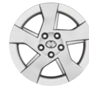
Standard 15-in. alloy wheel and wheel cover