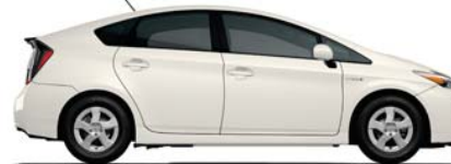
BLIZZARD PEARL Dark Gray, Misty Gray or Bisque interior