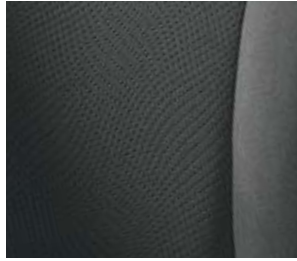
Fabric in Dark Gray