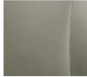
Leather available in Misty Gray