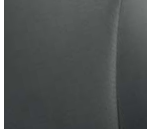
Leather available in Dark Gray