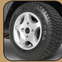
10-Inch Aluminum Alloy Wheels