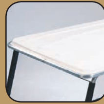
Canopy Top White and Beige