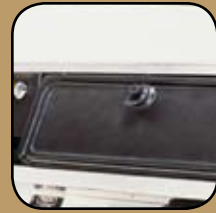
Glove Box With Lock With Lock