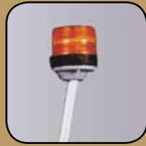
Post-Mounted Safety Strobe