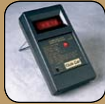
Communication Display Module