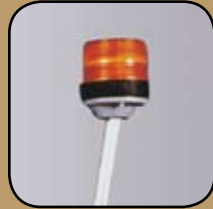
Post-Mounted Safety Strobe