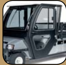
Certified ROPS Cab Enclosure