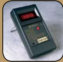
Communication Display Module