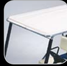
Canopy Top White