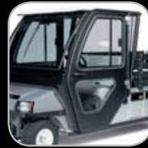
Certified ROPS Cab Enclosure