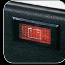
Battery Warning Indicator