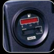
Fuel Gauge and Hour Meter