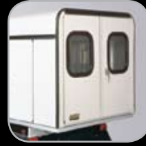
Custom Van Box