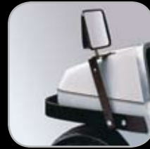
Heavy-Duty Bumper/ West Coast Mirror