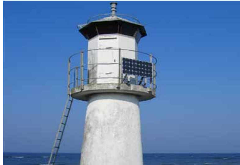
SwedModule on a lighthouse at Laus Holmar in Gotland, Sweden