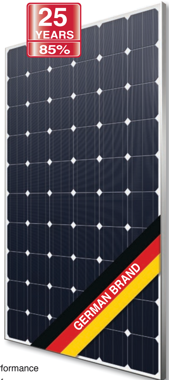
Fig. similar 60M156EN151026A

Exclusive linear AXITEC high performance guarantee!